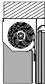
B - recess